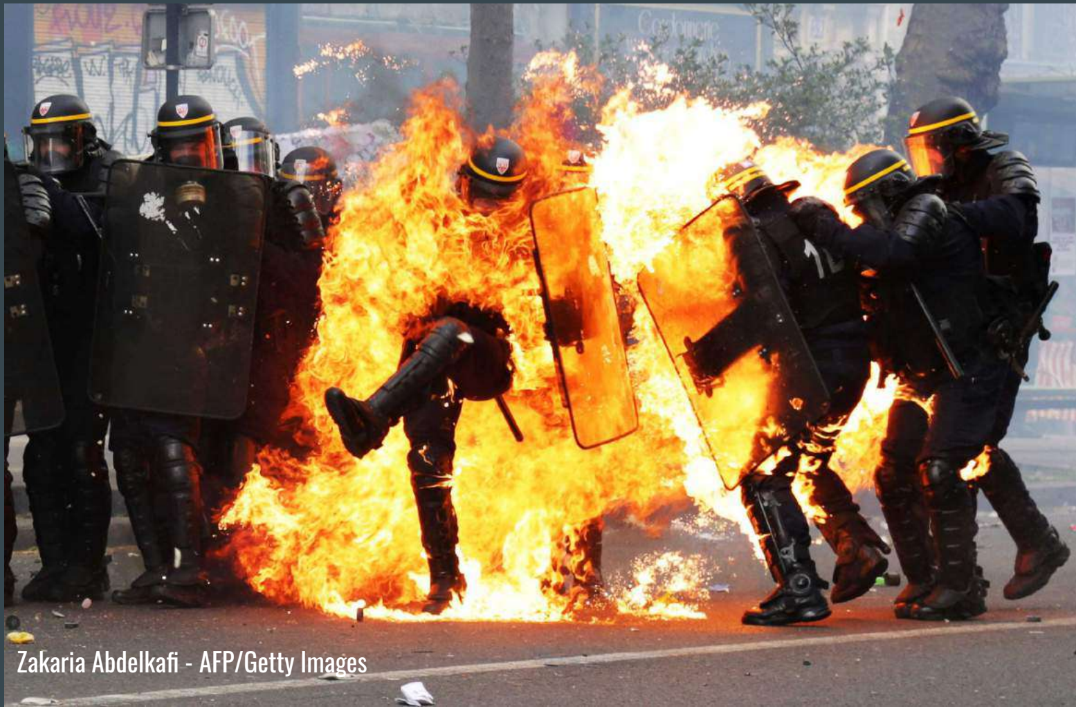
Zakaria Abdelkafi - AFP/Getty Images